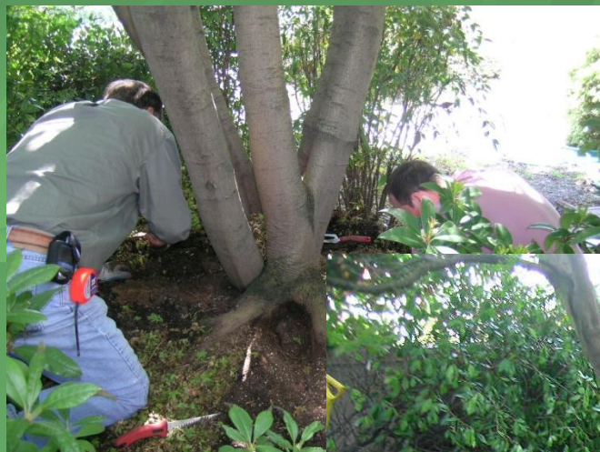
King 5, Seattle, WA Case Study