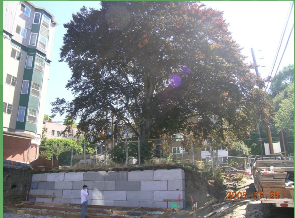
Copper Beech Apts. Case Study Queen Ann Hill, Seattle, WA