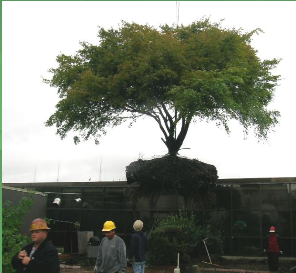
King 5, Seattle, WA Case Study