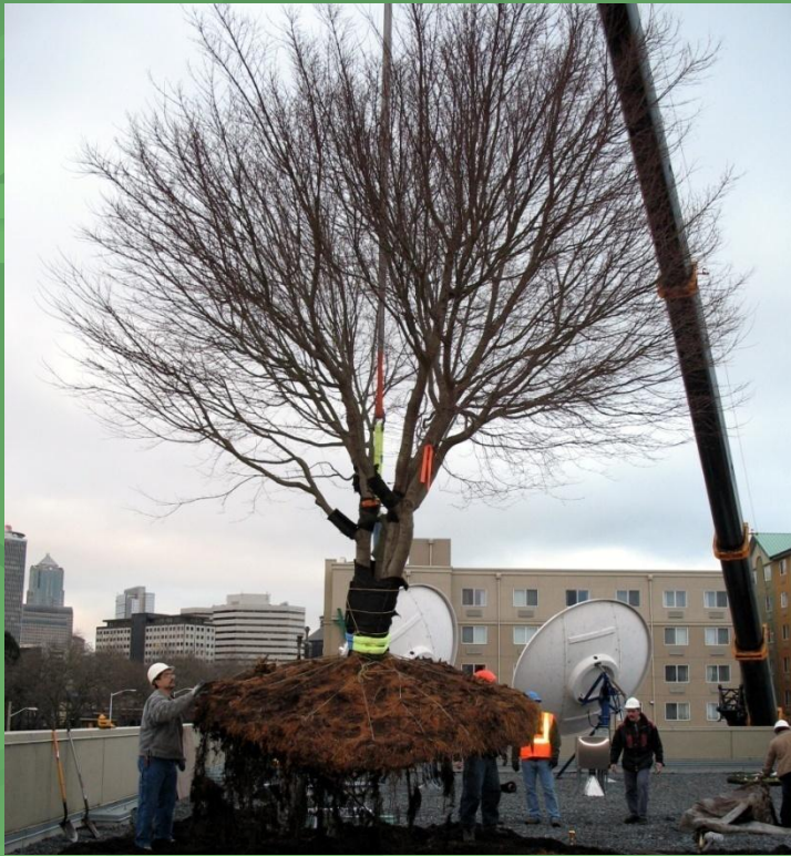
King 5, Seattle, WA Case Study