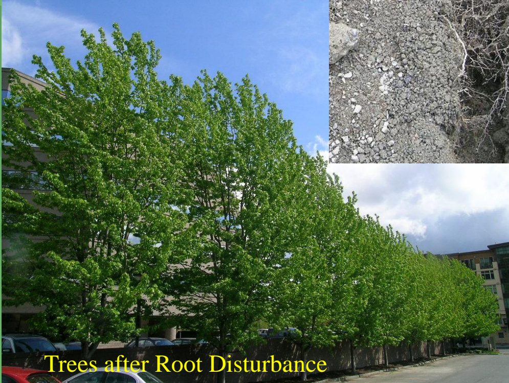
Trees after Root Disturbance

Mercer Island, Private Project Case Study