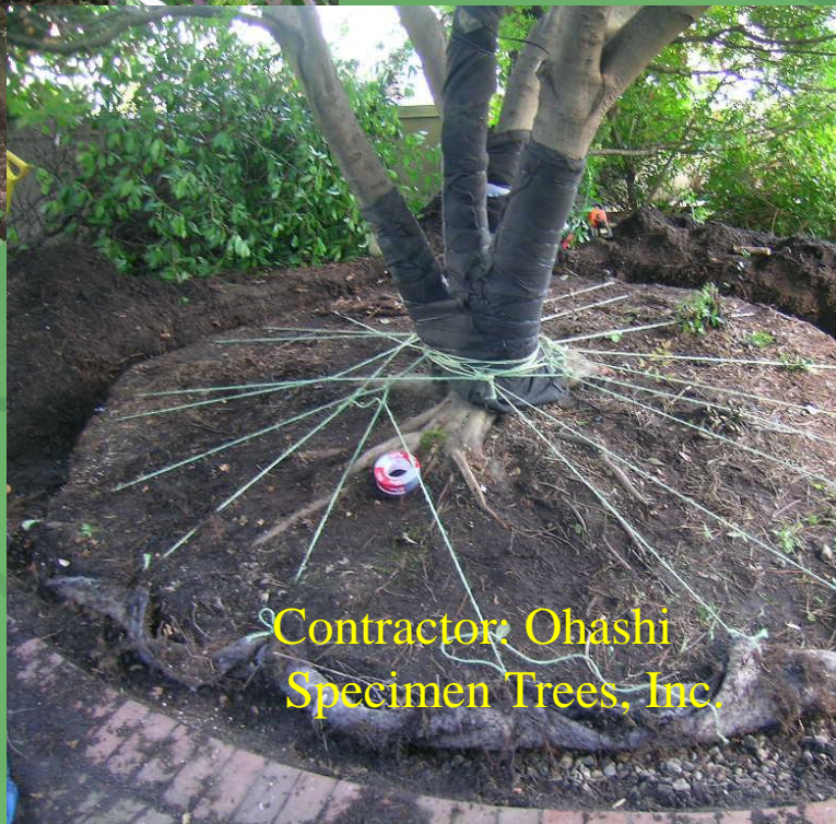
Contractor: Ohashi Specimen Trees, Inc.